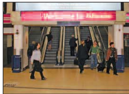
New Street Station

We're only 10 minutes walk away from New Street Station and you can get to see a little of Birmingham on the way.