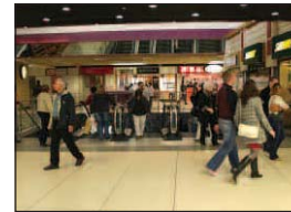
New Street Station

3. Walk down the steps by the fountain and head left down the pedestrianised street, passing EAT on your right and Tesco on your left, until you reach the tourist information booth outside Waterstones.